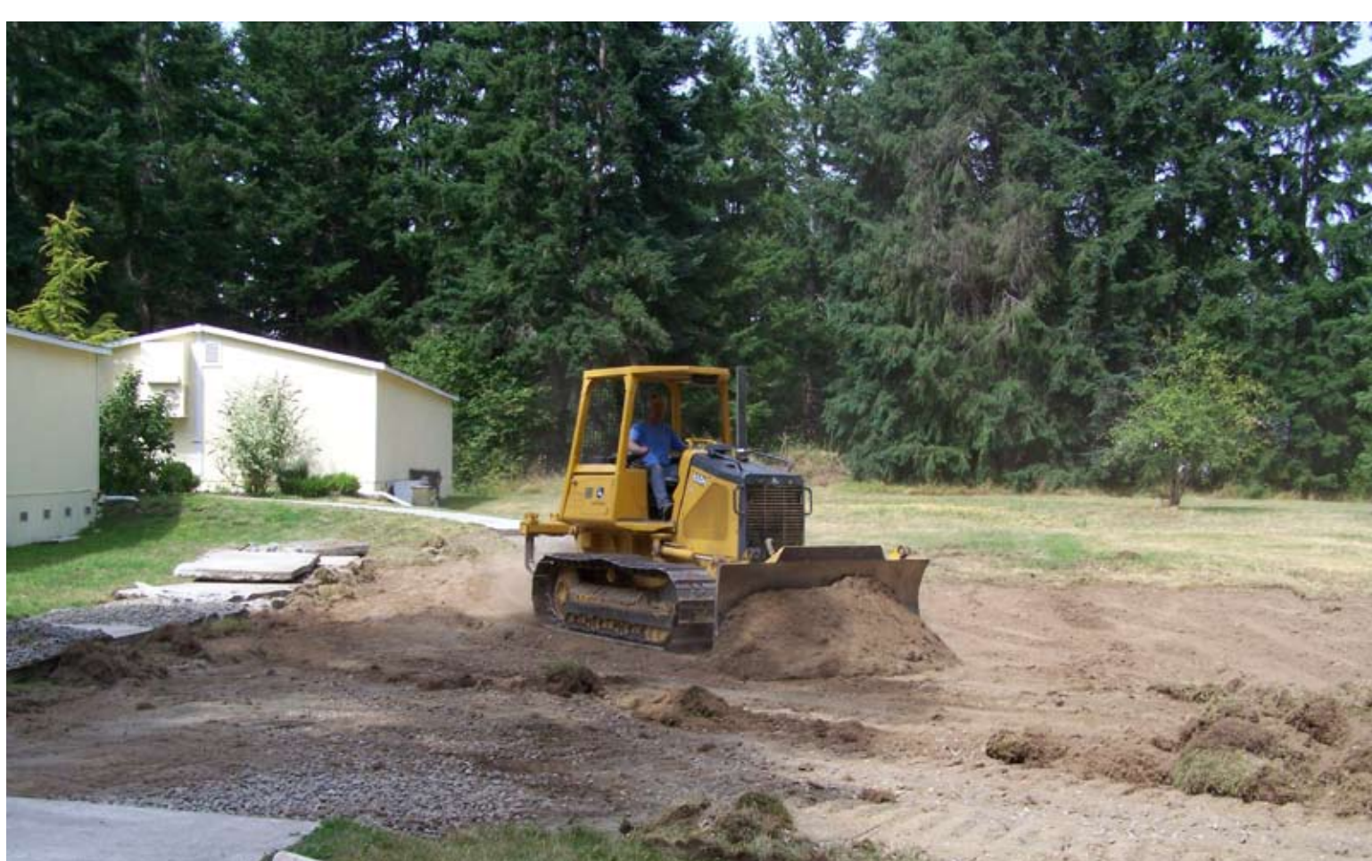
August 12th - Ground Breaking