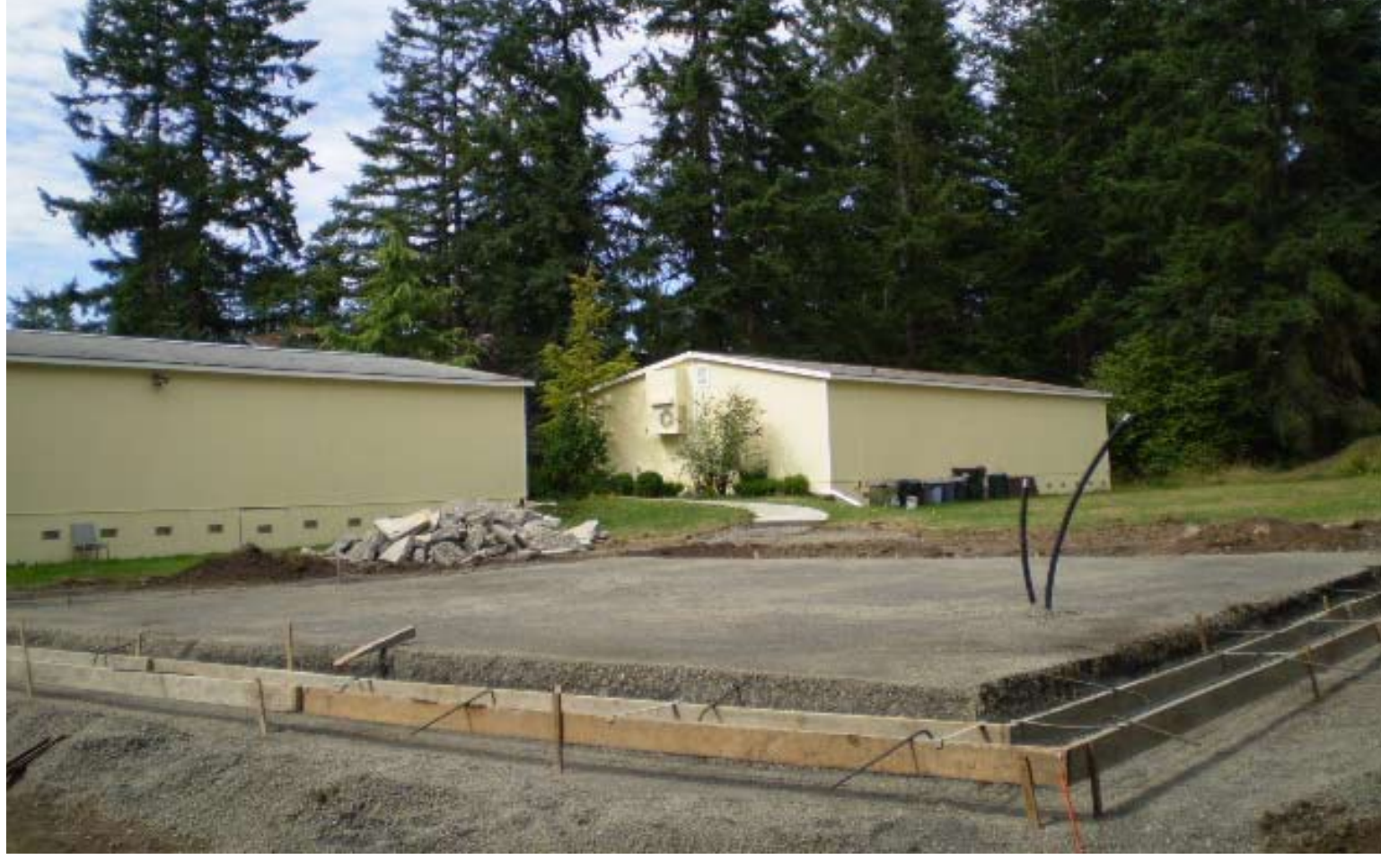
August 22nd - The New Building Foundation